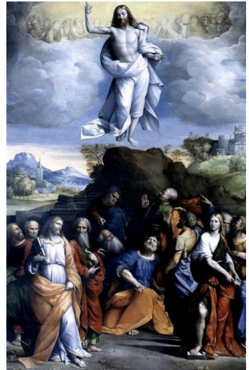
Ascension of Christ 1520 by Garofalo

"When the day of the Pentecost had come" signifies the gathering of Jesus' followers for the purpose of harvesting the blessings of spirit. The first Pentecost after his ascension was the time of the first coming of the Holy Spirit to baptize the disciples. "They numbered about an hundred and twenty" and were praying for ten days for the Christ Consciousness to